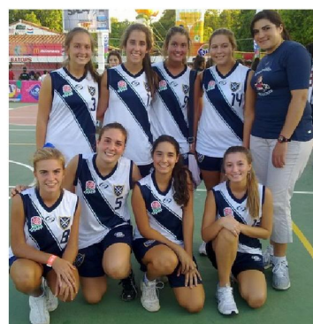
The sports teams have been busy

As part of our celebrations we have a project to redo the bathrooms at the Annexe school which haven't been done since they were built! Any profit from the events will be put towards them as well as fundraising things. It will be a long term project since they will cost 10 000pounds.