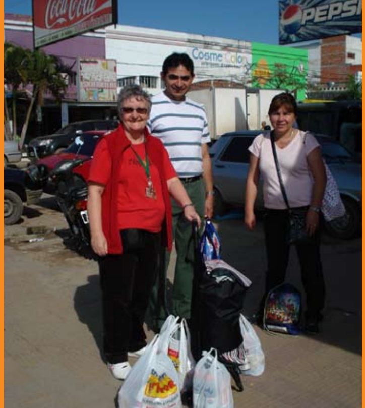
Shopping in Argentina with friends

We have all been watching the football Copa de America. Paraguay has not yet actually won a match but they reached the finals on penalties. As I write they have arrived in Buenos Aires for the final against Uruguay. By the time this goes to press we will know the worst or the best. Either way it will be