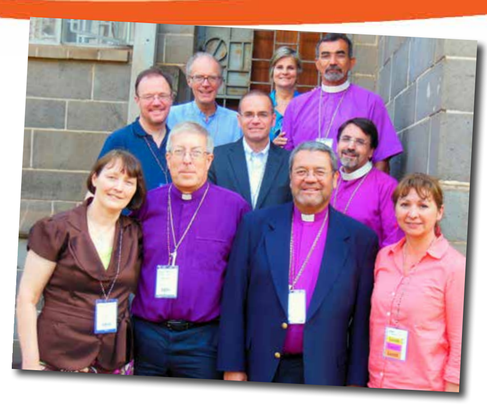
At Gafcon Nairobi 2013, representing the Anglican Church in Latin America

The whole conference enjoyed an afternoon at Nairobi National Park watching