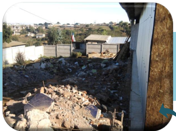
Chile. There used to be a church here. Now it is just rubble.