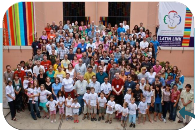
Latin Link International Assembly 2010 Peru.

The situation is really sad. Thousands of families have been left homeless and live in tents in the streets without electricity or running water. Many churches have also been completely destroyed.