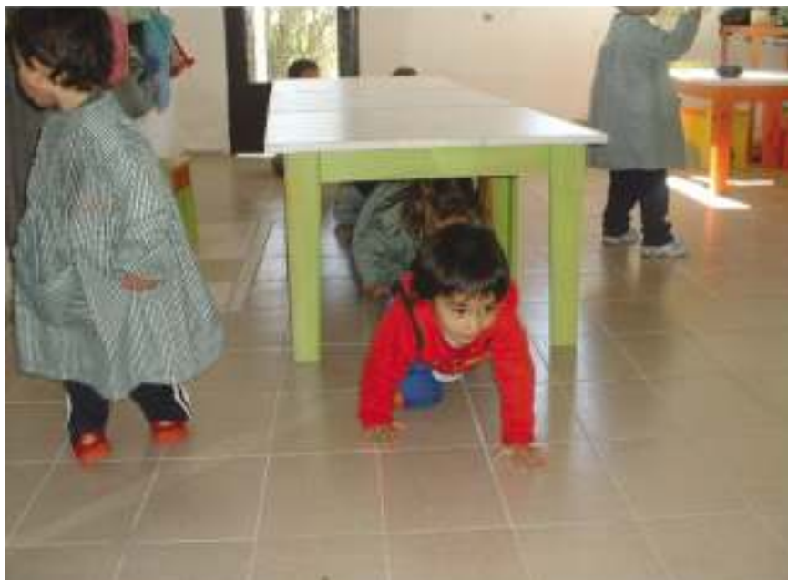
Early Years Education.