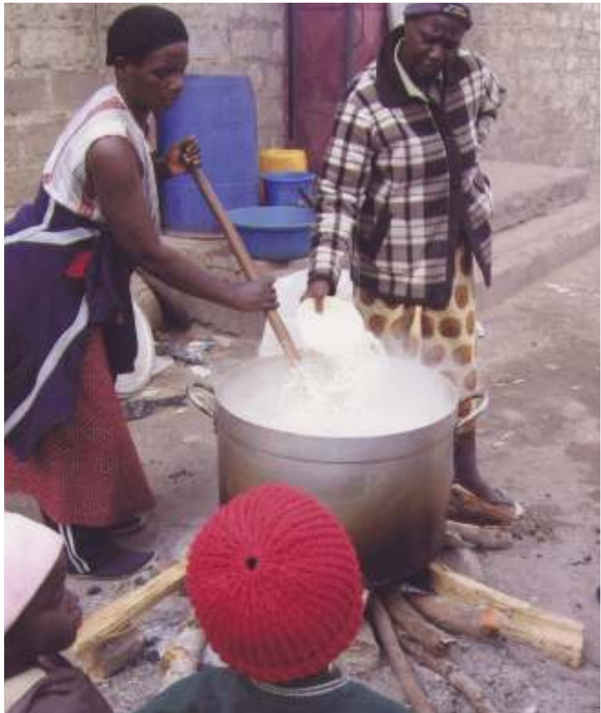
Cooking for children.

Recently, the Church has introduced literacy classes for adults. Almost 100% of the students in this programme are women. We believe that by educating the parents we are contributing to the welfare of children. Literate parents, particularly mothers, are better equipped to deal with challenges affecting children in urban settings. Through functional