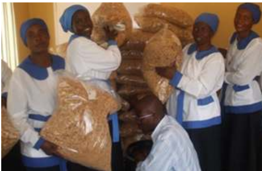
Willing workers help with the supplementary feeding scheme.