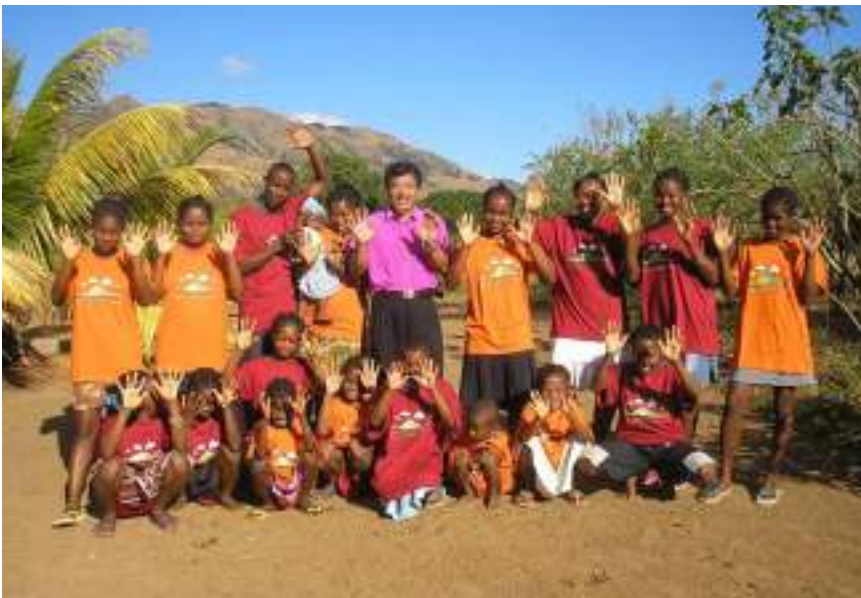
Happy children, Antsiranana.