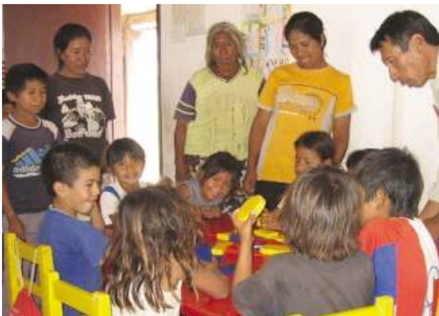
In class with new resources.