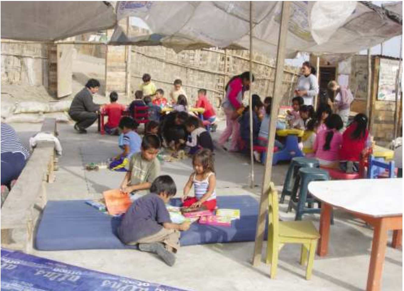
Child's play at El Arca.