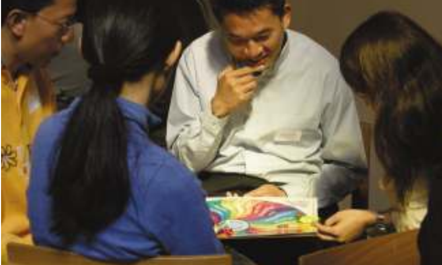
Feeling wheel board game.

In response to the terrible Sichuan earthquake, Hong Kong Sheng Kung Hui Ming Hua Theological College is working on a project to help children affected by such disasters. A workshop was set up for social workers and mental health professionals, led by a certified play therapist. It aimed at enhancing the participants' knowledge of children's post-disaster reactions using first-hand experience from games and exercises with young people suffering post-traumatic stress. Research has shown that children's reactions to disasters appear to linger and persist and are likely to cause much misery to them and their families. Some re-experience the events through recurrent thoughts or dreams about what happened, suffering intense distress at cues or reminders of the trauma. Others make great efforts to avoid thoughts or conversations about the event; they can have diminished interest in normal activities and feel detached or removed from other people. Difficulty sleeping or concentrating, as well as depressive reactions, are common. Increased fears – in young children fear of separation from parents or loved ones – or fears of loud voices,