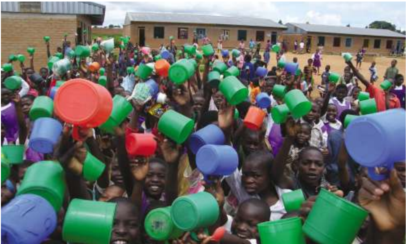
Joyful waiting for maize-meal porridge, Malawi.