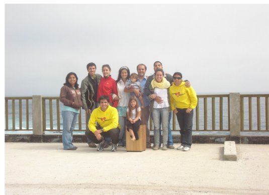
Church planting TEAM